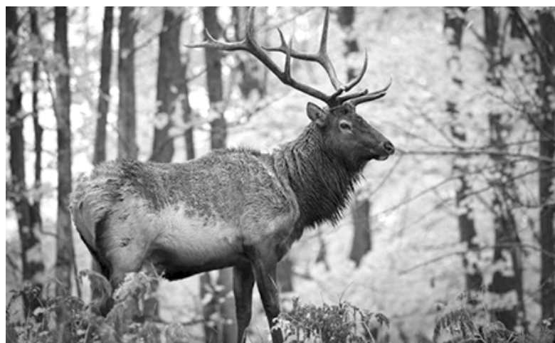
The first elk hunt season in Michigan started this week and lasts for 12 days.