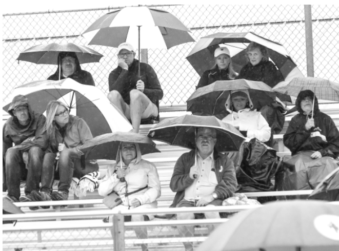
Rayder fans brace the weather as they support the team on a wet evening.

loss to Harbor Springs, it looks like the East Jordan football team is poised to play from the opening kickoff to the final horn as they did so against the Rams on Thursday, August 23.